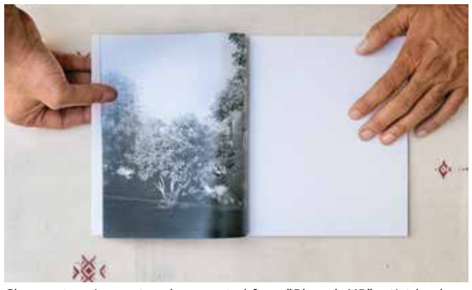
Champa tree in courtyard, excerpted from "Bhopal, MP" artist book.

2017, the title a dead give away to his working process, not only for this artist book, but more generally. In the actual exhibition space Dalal threaded around the two galleries complete Xerox copies of Swaminathans two texts to scale, anticlockwise, and above that placed other images from the books that did not directly correspond to the text and others which are not documentary images. By such placements Dalal creates a disjunction, where the image-text relationship is not illustrative, but rather can be apprehended as interpretive. Dalal's predilection for the dislocated image, one that has been serially copied, distanced and