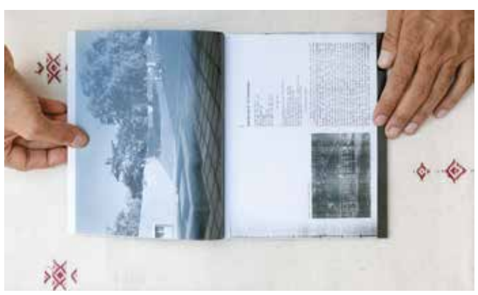
Bharat Bhavan and J. Swaminathan essay, excerpted from "Bhopal, MP" artist book.