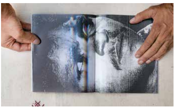
Jangarh Singh Shyam, excerpted from "Bhopal, MP" artist book.

As Dalal writes in a short, ruminative text "Contrapuntal Moves and Counter-System: Notes included in Bhopal, MP", both Correa and Swaminathan at the moment of the birthing of this arts complex are engrossed with matching, elaborating, and even transforming, in their own ways, the 'lessons' of modern Western art and architecture by formulating a series of counterpoints which come to be embodied by the buildings of