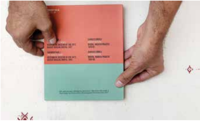
Slipcase cover, "Bhopal, MP" artist book.

There is a conspicuous absence of authorial text in the book. Dalal has crafted an image flow which is attentive, allowing all these varied materials to rebound and reflect one another. Swaminathan's words are made available through either the poor Xeroxes or the high resolution scans, in English and Hindi as they were originally published — alongside Dalal's photographs of the exterior aspects of the Correa buildings. Dalal's images of the buildings are taken informally, as he himself wandered around the complex; becoming almost visual notes rather than overtly staged, formal architecture studies. They underscore that there are some inherent difficulties